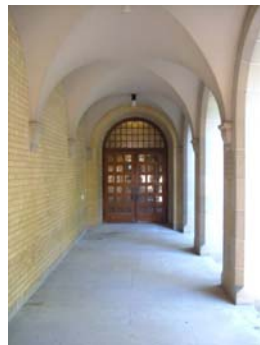
Photo 1 - Building