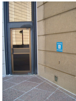
Photo 1 - Building