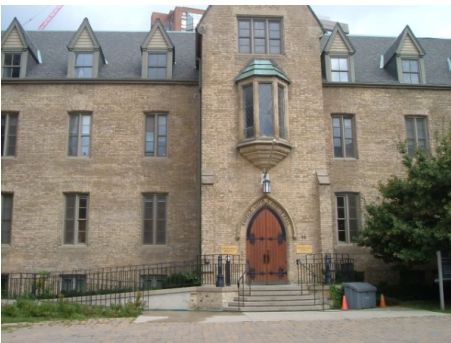
Photo 1 - Building