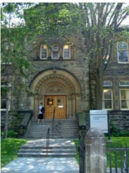
Photo 1 - Building