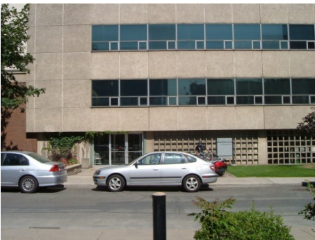
Photo 1 - Building