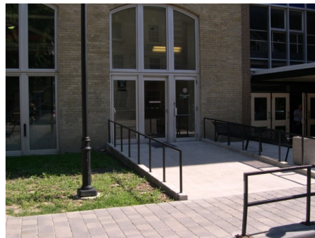
Photo 1 - Building