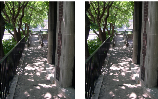
Photo 1 - Building