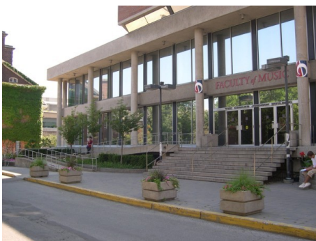
Photo 1 - Building