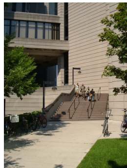
Photo 1 - Building